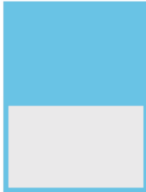
1/2 PAGE HORIZONTAL 7.875" x 4.875"