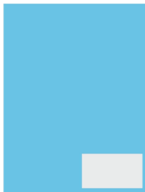
1/8 PAGE HORIZONTAL 3.825" x 2.625"