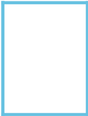
FULL PAGE 7.875" x 10.375"