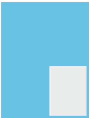
1/4 PAGE HORIZONTAL 3.875" x 4.875"